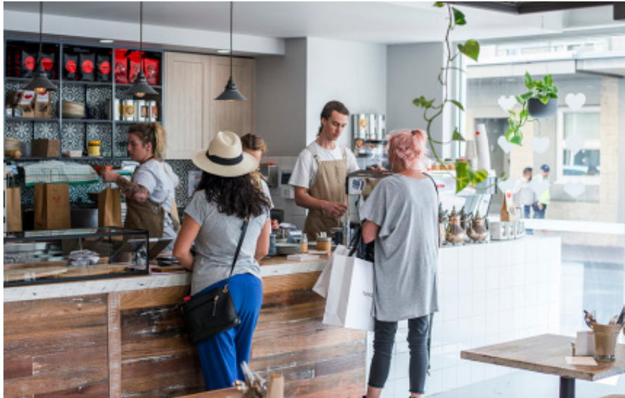
Heart Cafe CAFE