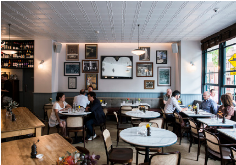
Caffè Bartolo RESTAURANT